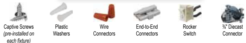
Captive Screws (pre-installed on each fixture)